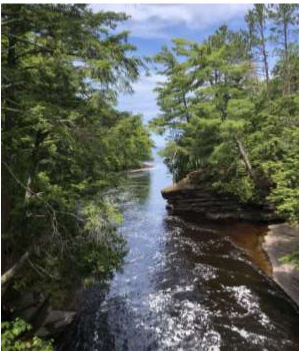
Left: Presque Isle Falls.