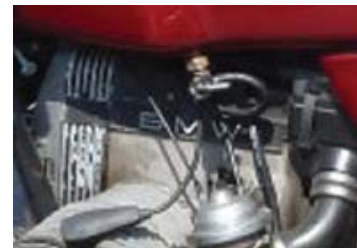
Above: Heidi's bike before Below: After powdercoating