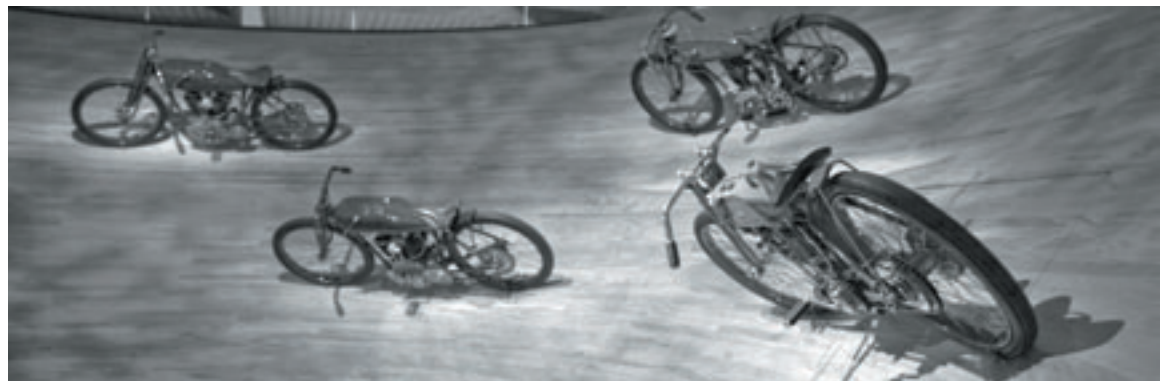
SPORT TWIN 1919-1923

Not good. I'm now wet from head to toe and starting to feel a slight chill. That sets off all of my riding alarms. I don't mind a little wet or even a lot wet as long as there isn't a "I'm cold" component. As soon as that clicks in I start looking for a place to warm up or to turn around and head home. Hypothermia is not something to mess around with. It dulls your reaction time and your judgement. Fall is prime hypothermia time with the cooler weather, lower sun and shorter days. I chose to head back to the barn and dry out my soggy "waterproof" riding gear. I'm sorry I missed the meeting but I'm glad I made the right choice. Maybe next time I'll try rolling in fresh lard as a solution to this "waterproof" conundrum.