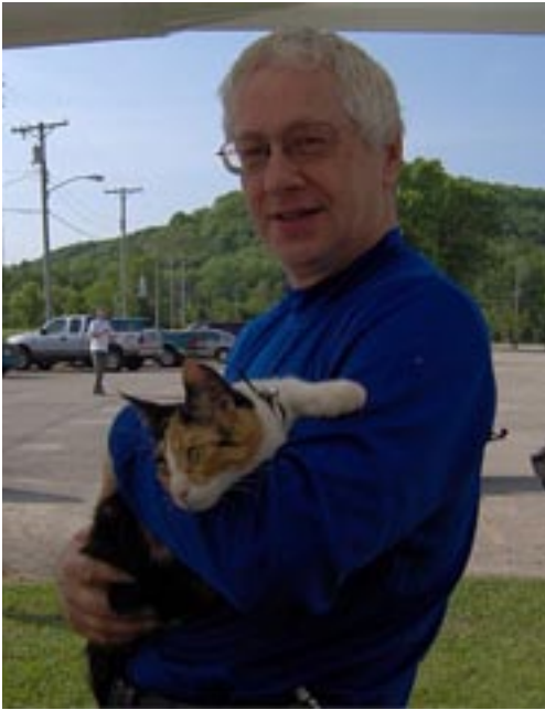
Above Left: The rally was enjoyed by beasts of all kinds.