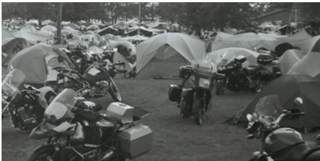
The best I good do to show you the “sea of tents” and how close together most were...