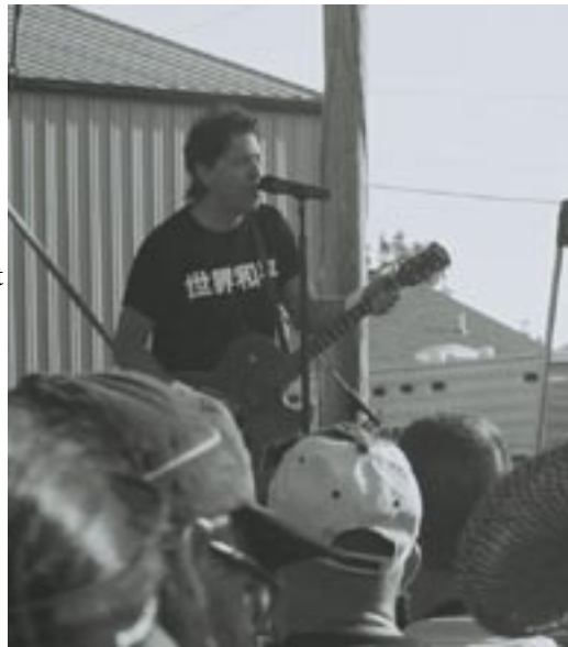
George Thorogood "raises the roof" at Beemerville

A tour of the rally site proved that the committee had gone to a lot of planning. Yes, tents were stacked on top of each other but not for lack of space. Everyone was