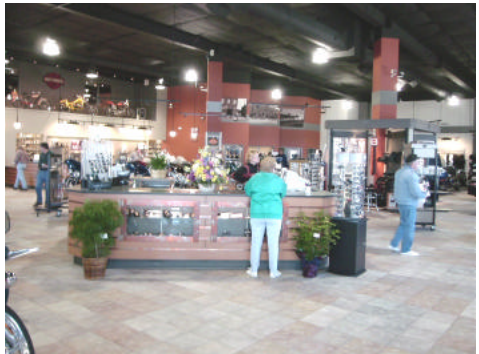
Front checkout desk for accessory and clothing sales.

Mary and I decided a second look in the company of Prez Steve was in order. We stopped by a few nights later to spend more time talking to people and looking around. Arriving after dark, the subtly illuminated BMW building signs were now barely visible. A closer inspection revealed that, despite the compression of BMWs into a small area, significantly more were on display throughout the building, including the service area.