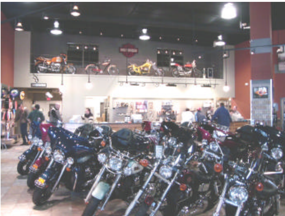
The way to the service area is on the left of the parts counter.

New address: N8131 Kellom Road Beaver Dam, WI 53916 Phone: 920-887-8725 FAX: 920-887-0080