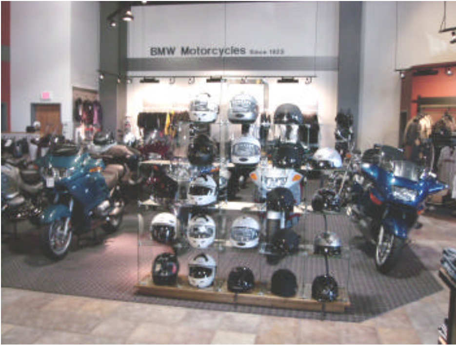
The BMW motorcycle and accessories showroom area. Could it be more than a coincidence that the only helmet display is here?